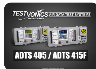
ADTS 405F / 415F Software