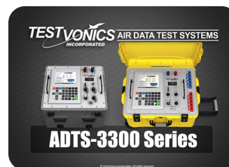
ADTS-3300 Series Software

sets. ADTS4X5F software provides automated test and calibration for the ADTS405F, ADTS415F and DPS500 (and variants); EccADC software provides automated test and calibration for TTU-205J; and ADTSCal software provides automated test and calibration for ADTS-3350ER, ADTS-3350MR, ADTS-3300JS. The applications provide increased test consistencies while lowering touch labor hours and costs for testing and calibration.